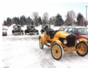
Jan 2001 E I's Breakfast Time