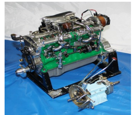
Here is the engine removed from the model and sitting on its test stand. The transmission is in the foreground.

Most running models are built at larger scales like 1/3 or 1/4. Working in the smaller 1/6 scale magnifies the problems caused by miniaturizing certain parts. Remember that these scale parts are 1/6 as long, 1/6 as high and 1/6 as deep as real parts, making them 1/6 x 1/6 x 1/6 or 1/216th the volume of the original part. By comparison, a 1/3 scale model is 1/27th the volume and a 1/4 scale model is 1/64th the volume. Further complicating the prospect of building a running engine at that size is the fact that fuel molecules and electricity don't scale. It is very difficult to get tiny carburetors and little spark plugs to work like the big ones. A video of Lou starting and running the engine for the first time can be seen at http://www.youtube.com/watch?v=f6TetkMpFI