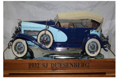
Here's a shot of the finished car from the side on its specially made display table. The model weighs about 60 pounds.

Louis Chenot has spent the past ten years building this incredibly detailed 1932 SJ Duesenberg LaGrande dual-cowl phaeton. Not only does it look good, but the engine runs, the lights work, the top mechanism functions and the transmission and driveline are complete. Lou started his research on this project over fifty years ago with the purchase of a book and through the following years collected many drawings and studied a number of Duesenbergs while they were being restored, taking photos and recording dimensions.