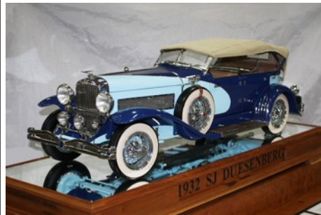
No, it's not a real full-size Duesenberg, but rather a beautifully constructed 35" long working model made in 1/6 scale.