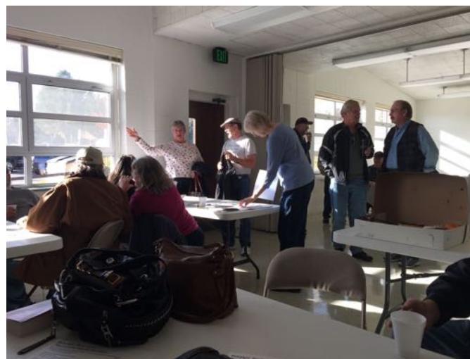
Several chapter members enjoying treats before hitting the road in the 2015 Pumpkin Daze Membership Drive.