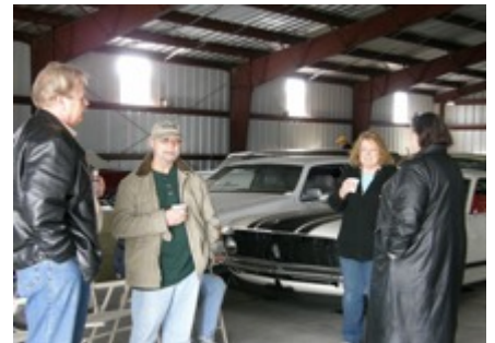
We met at Ike's after the Blackfoot Potato Museum Tour to finish up tour.

Would you like to receive this newsletter in Full Color? If you have an "E-Mail Address" please send it to me and I will add you to the "Growing List" of satisfied colored N L recipients. With the US Postage going up each year this would help this chapter put this money to a better use.