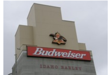
This Building contains the grain bins which house farm crops needed to make beer