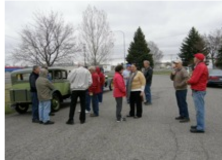
E I Members gathering for the 2011 Dust Off Tour to Budwieser and Blackfoot.