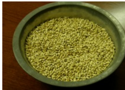
This is the grain raised in the Idaho Falls area and used in the processing plants