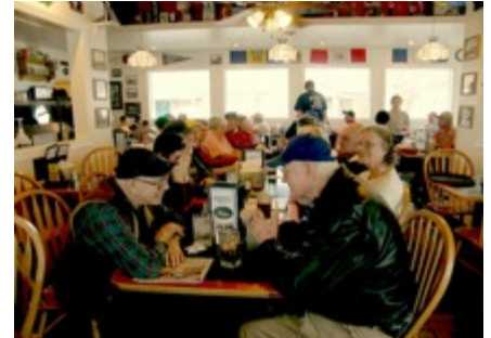
Now we are at Rupe's Restaurant having lunch prior Blackfoot Potato Museum