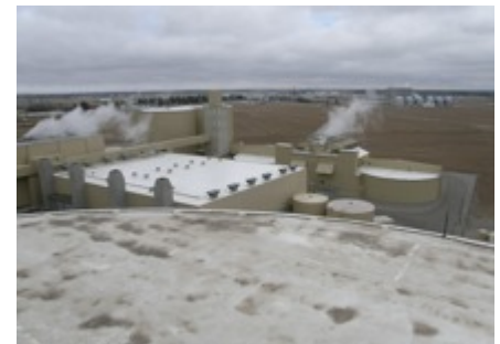
On top of the granaries looking out over grain processing facilities.