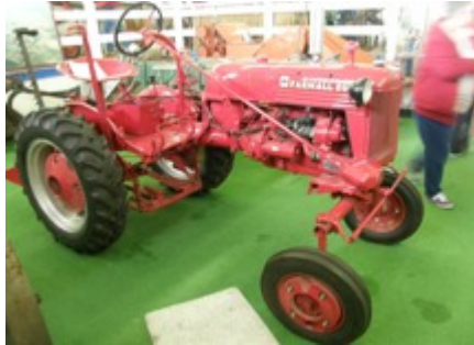
Farmall Tractor in the Blackfoot Potato Museum