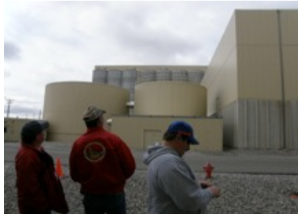
Looking back at the granaries we were on top of in previous picture