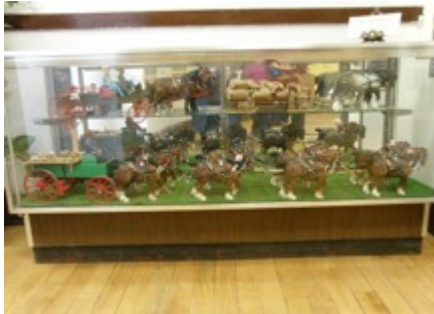
Blackfoot Potato Museum Wagon & an 8 horse wagon team display