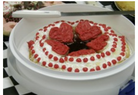
Would you say that this meets the valentines Day color requirements? It was very good