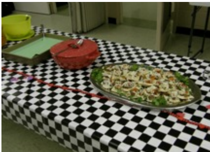
Some of the menu meeting the color requirements. We all thank the great cooks