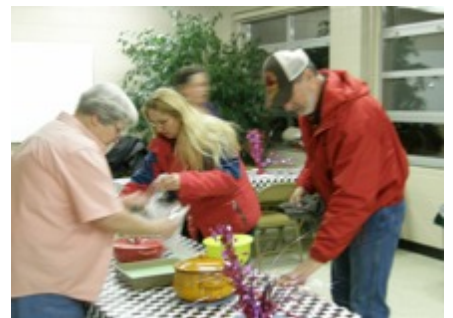
The troops bring in the goodies for the club to devour prior to the meeting