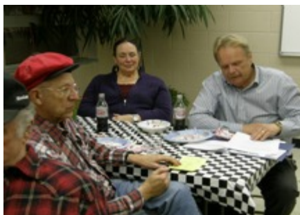
Everybody is full so the boss gets on with the meeting as a great president does.