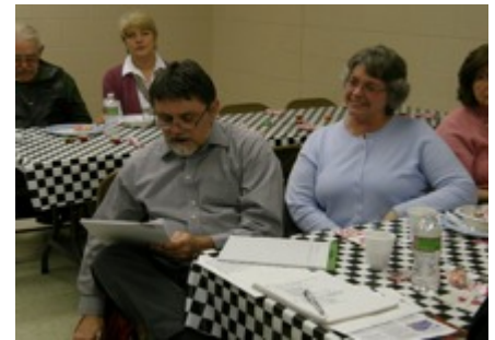
The secretary reading the minuetts from the last meeting. We all had a great evening