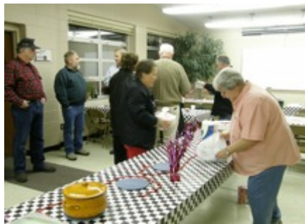
Getting ready for the valentine dinner and Club meeting of the Eastern Idaho Chapter

The February meeting was a little different. We had a Valentines Day Pot Luck Dinner Meeting. All supplied dishes had to meet the Valentine color criteria. It turned out to be very very good. Our thanks to All who participated with the great food. The pictures below will show you what you missed if you were not there. Editor