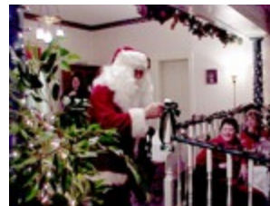
E I Dec 15, 2000 Activity